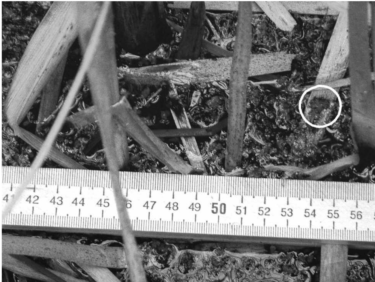
FIG. 2. Photo of the free-floating liverwort Ricciocarpos natans beneath a canopy of Typha at the Point au Sauble study site (complex 1106). An individual plant is circled.

not associated with bogs or fens were elliptic spikerush ( Eleocharis elliptica ), buttonbush ( Cephalanthus occidentalis ), and rose-mallow ( Hibiscus moscheutos ).